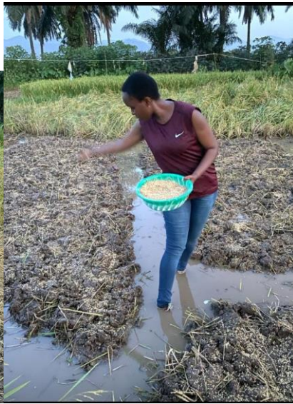
On April 3 and 4, 2024 we planted the rice in the fields