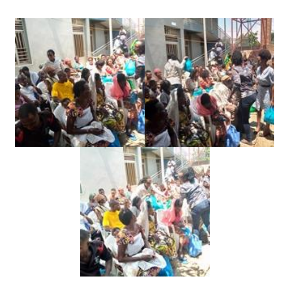
Maternity Ward Building

Although Ntaseka maternity ward still needs some medical equipment; both the delivery and the hospitalization services are currently functional.