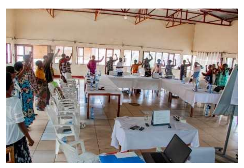
Energizer during the training

On September 5-7, under the support of Quakers Service Norway, FWA organized a three-day retreat for GBV survivors' accommanists at MIPAREC centre MUGATUTU in Gitega province. They were invited with their spouses to learn about the Maison Fidele approach wwhich is very important for GBV prevention.