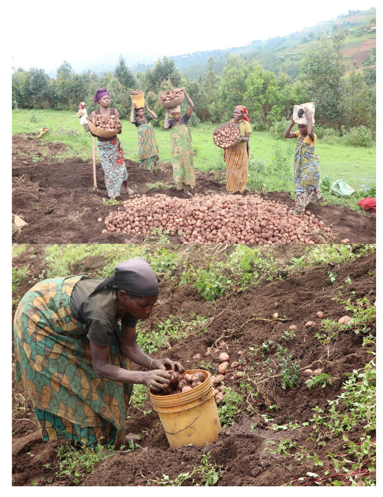
It's the harvest time: 524kg were harvested by the Batwa SHG at Mwumba hill while 582kg were harvested at Bubaji hill. 250kg of potatoes were planted at both the two hills