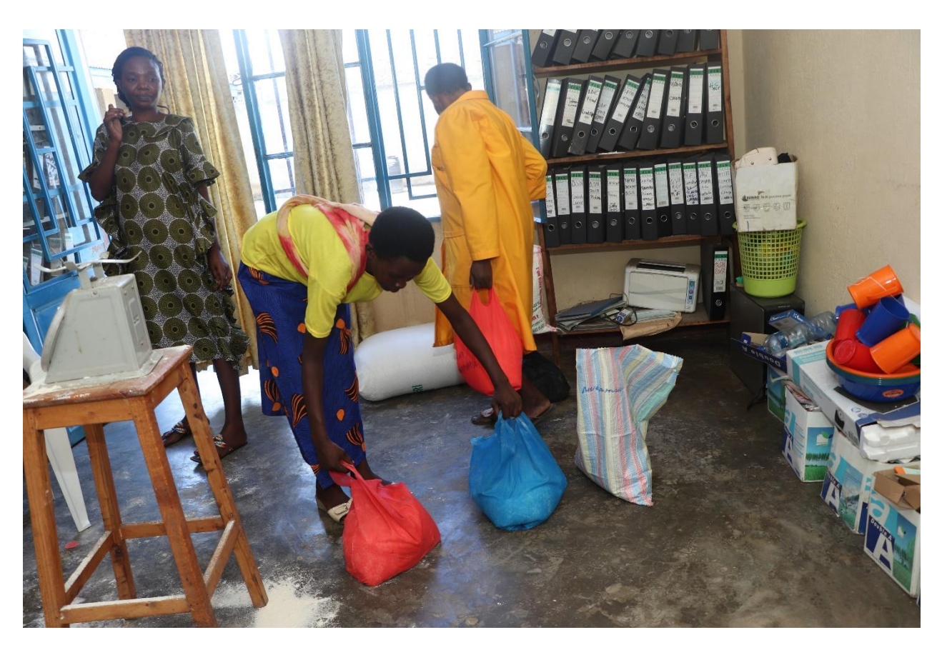
Nutritional Support for HIV Positive People