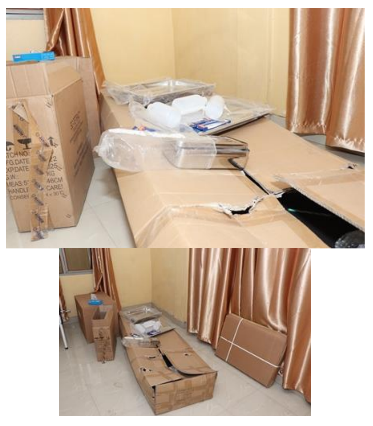
Ntaseka Clinic Maternity ward new equipment