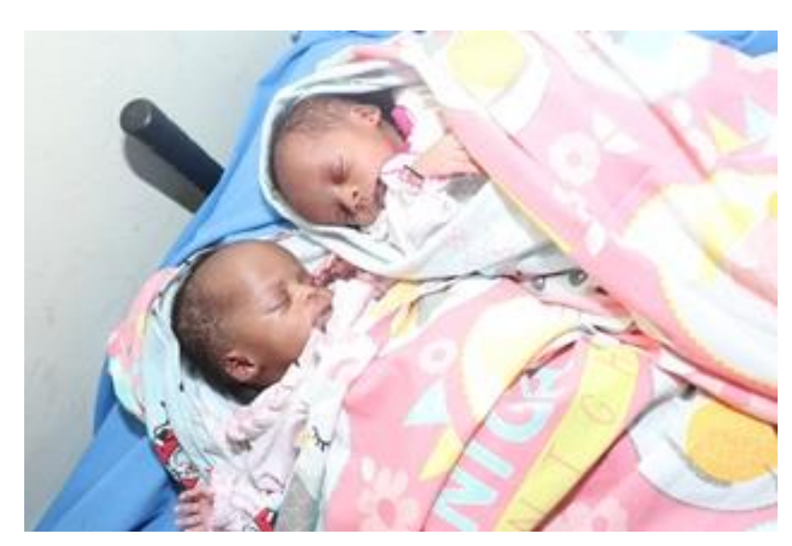
2. NTASEKA CLINIC MATERNITY WARD