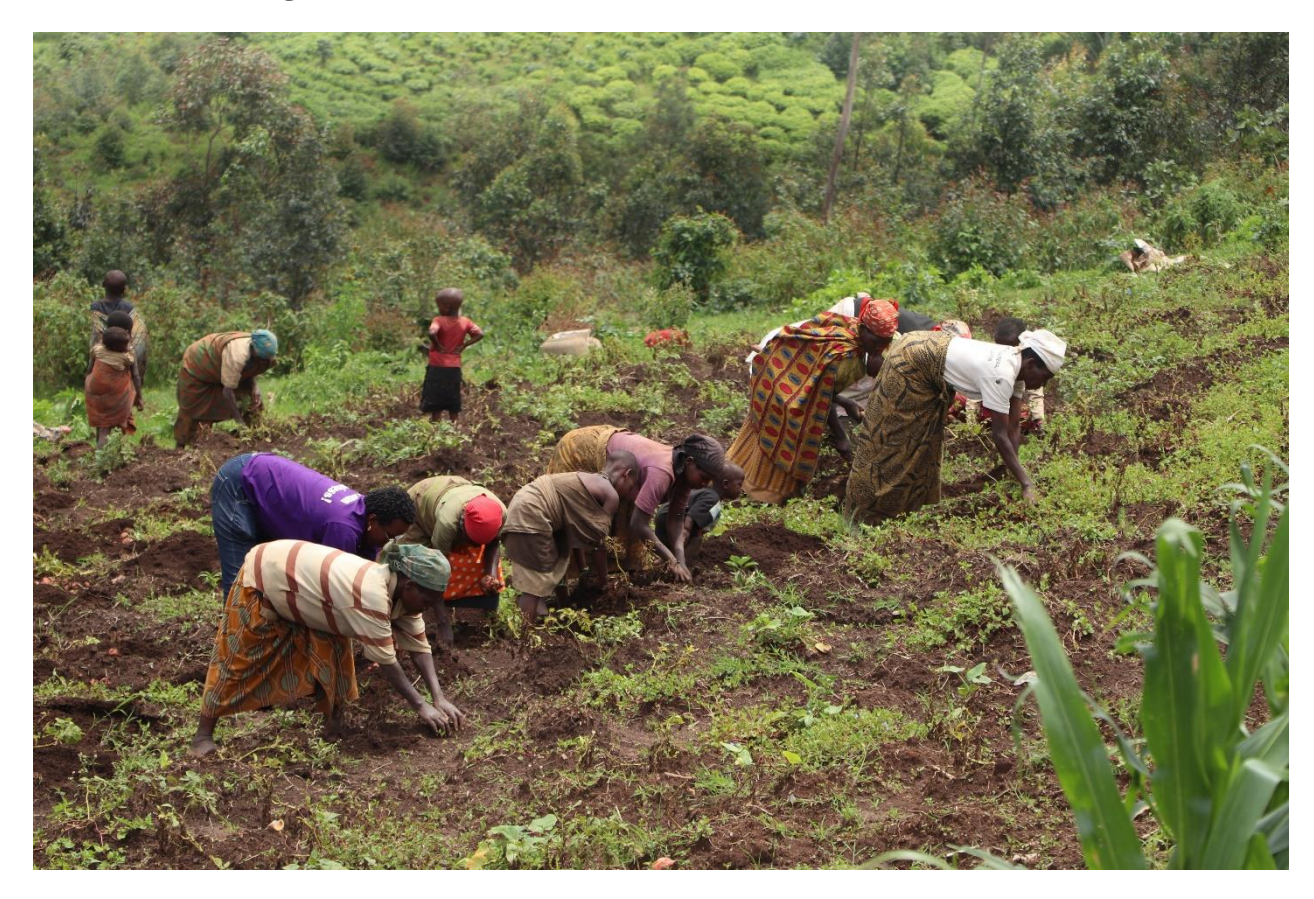
The Potatoes harvest at Mwumba hill, Nyabiraba commune, Bujumbura province