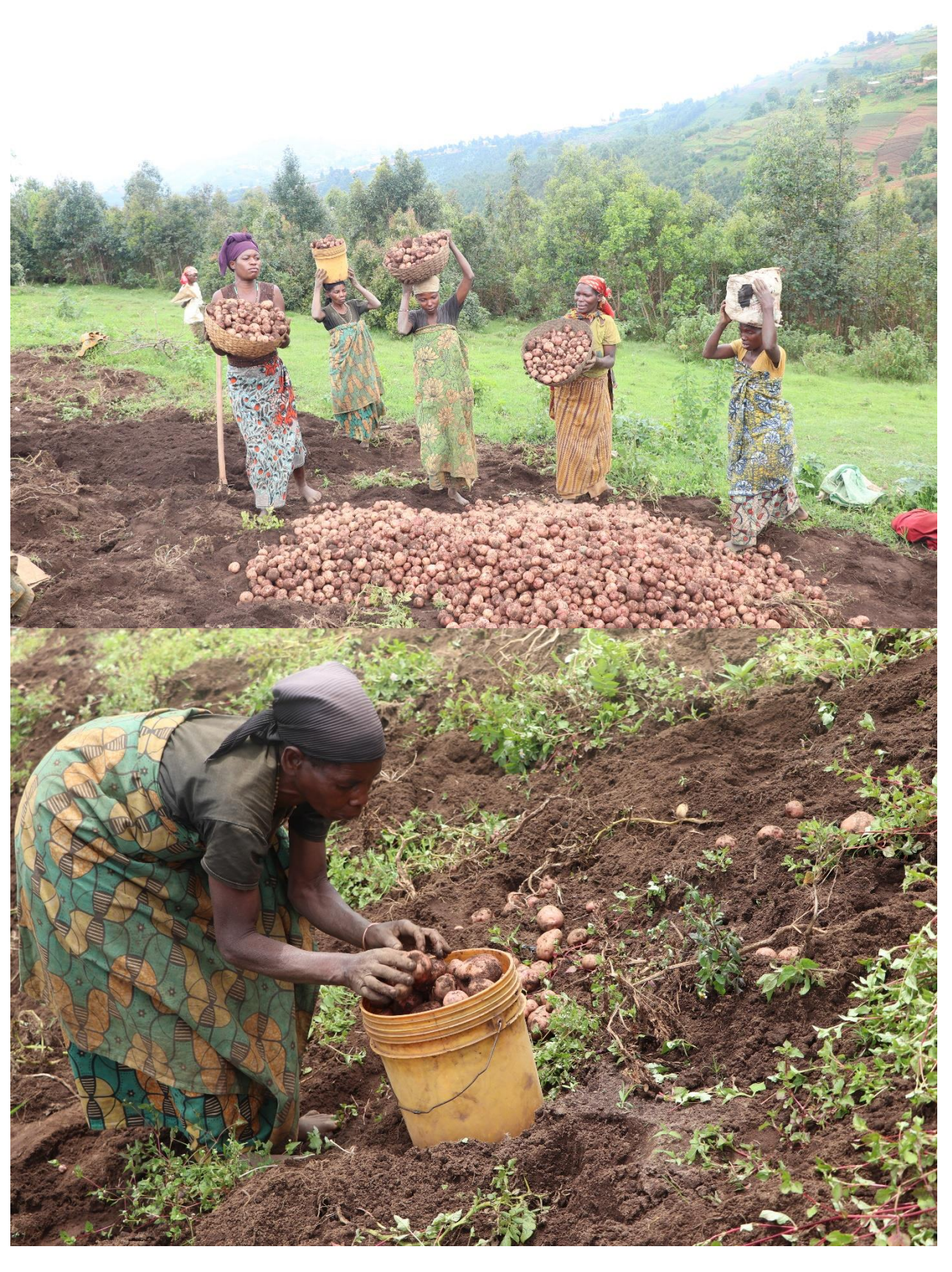
It's the harvest time: 524kg were harvested by the Batwa SHG at Mwumba hill while 582kg were harvested at Bubaji hill. 250kg of potatoes were planted at both the two hills