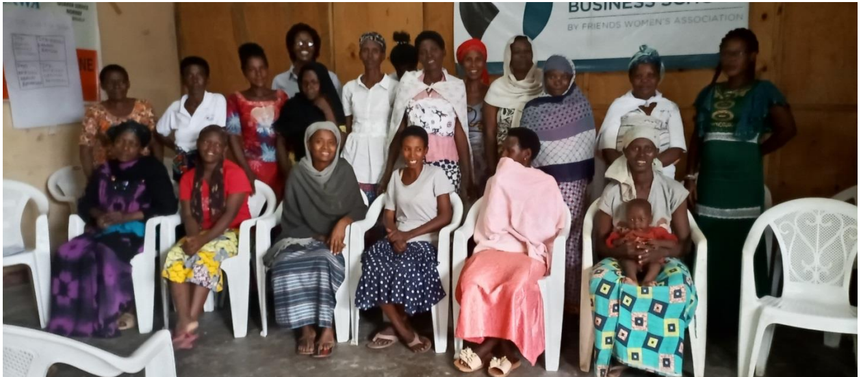
A group photo after the tree-day trauma healing workshop