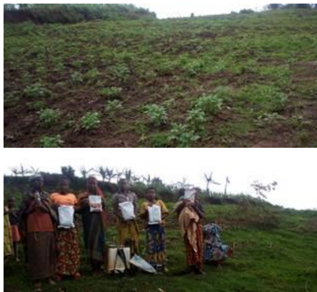
A group of beneficiaries (From Bubaji hill, Nyabiraba commune, Bujumbura province) with the potatoes fertilizer