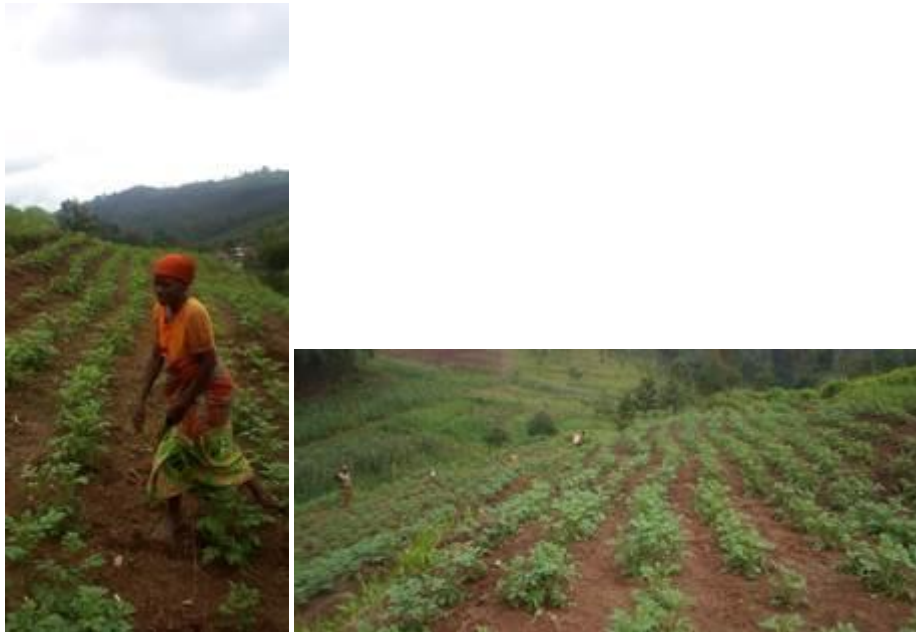
The Growing Potatoes Project at Mwumba hill, Nyabiraba commune, Bujumbura province