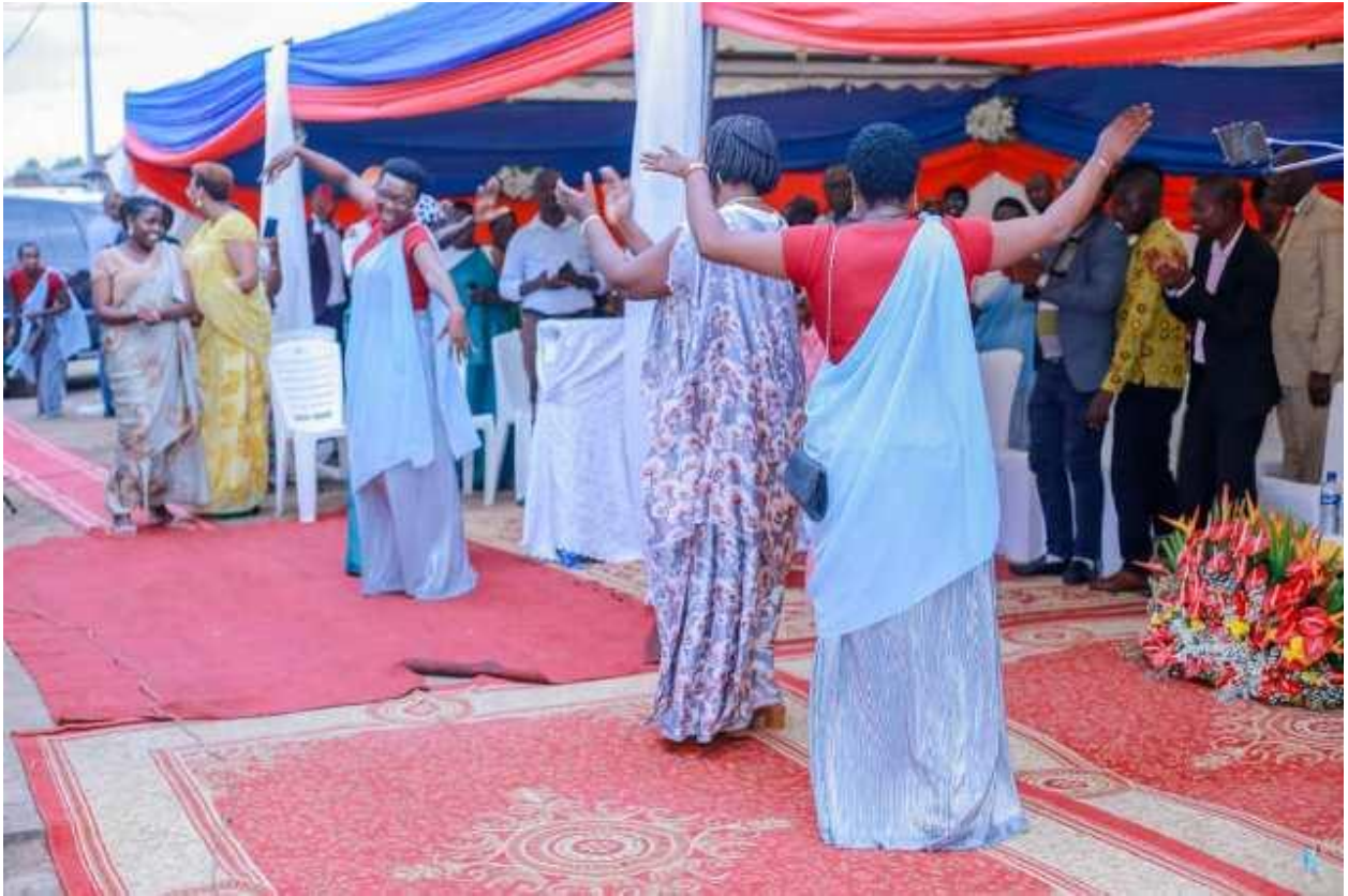
Joy and dancing after the Ntaseka clinic maternity ward official inauguration

https://www.youtube.com/watch?v=RQzgGnDNXr4&authuser=0