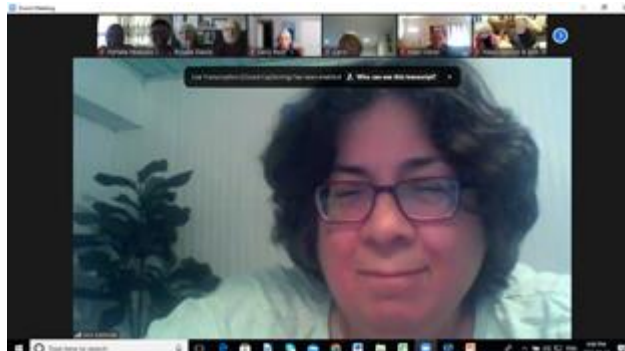
A member of Stony Run Friends Meeting