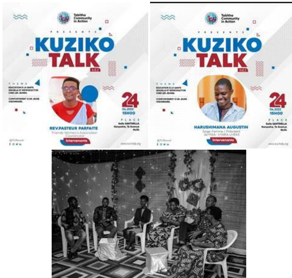
The picture above shows the team of speakers receiving questions from the participants