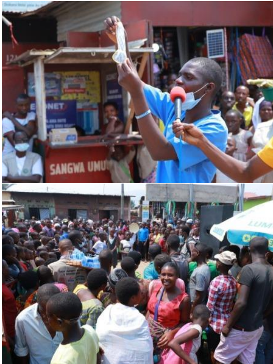
Group discussion on Family Planning